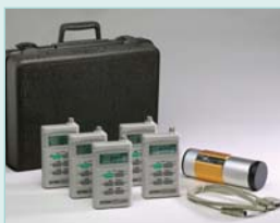
407355-KIT-5 Dosimeter Kit

Includes PC Windows® compatible software to maintain records and statistically analyze acquired data